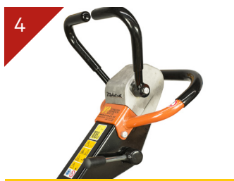
Variable Speed Controls