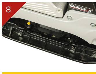
Removable Extension Plates Excludes: MVHR60HA, MVH128, MVH158