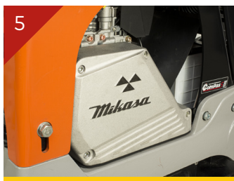
Enclosed Belt Guard