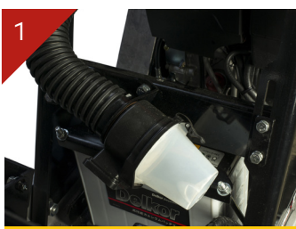
Cyclone Air Cleaners

Easi-load Tilt-deck Trailers. Custom tilt trailer to suit Mikasa Reversing Plates.