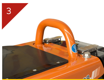
Sturdy Lift Frame